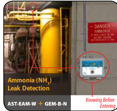
Arenas - Ammonia Compressors