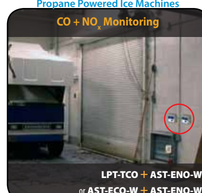
Zamboni Exhaust & Propane Powered Ice Machines