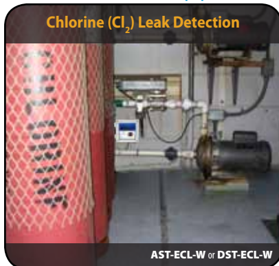
Pools - Chlorination Equipment