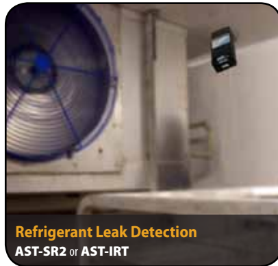
Bakeries - Freezer or Cooler