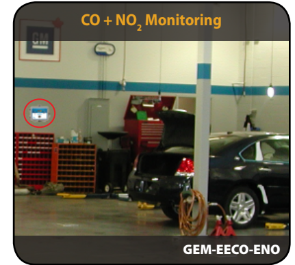
Repair Shops - Gas & Diesel Engine Exhaust