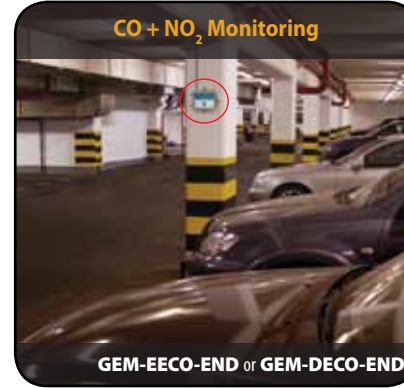
Parkades - Gas & Diesel Engine Exhaust