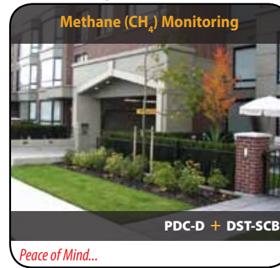
Building on Old Landfill Sites