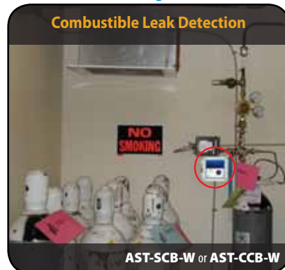
Warehouse Storages - Gas Tanks